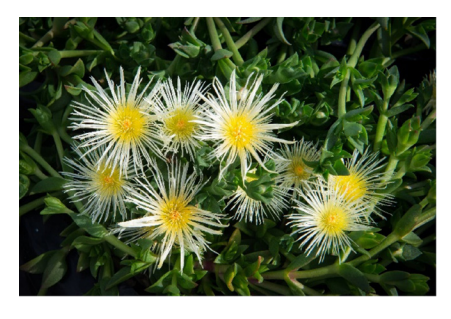
Zembrin is a special cultivar of traditional remedy Sceletium tortuosum grown sustainably and supporting the San Council of South Africa.

Zembrin has a patented phytochemical profile and a patented dual mechanism of action. It is backed by an extensive portfolio of science covering safety, mechanism of action and efficacy.